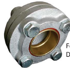
Female x Copper Flanged Dielectric Union