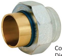
Copper x Female Dielectric Union