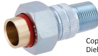
Copper x Male Dielectric Union